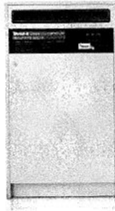
Standard Console 32 Gallon 36"H x 20 1 / 2 "W x 16"D Floor space: 328 ft 2