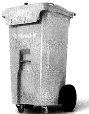
65 Gallon Tote with High Security Lid 46"H x 24 1 / 2 "W x 27 1 / 2 "D Floor space: 673.75 in