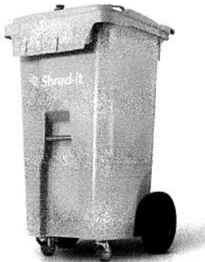
65 Gallon Tote with High Security Lid 46"H x 24 1 / 2 "W x 27 1 / 2 "D Floor space: 673.75 in