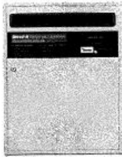
Mini Console 31 Gallon 26"H x 20 1 / 4 "W x 19 3 / 2 "D Floor space: 397.4 ft 2