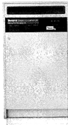
Standard Console 32 Gallon 36"H x 20 1 / 2 "W x 16"D Floor space: 328 ft 2