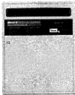
Mini Console 31 Gallon 26"H x 20 1 / 4 "W x 19 3 / 8 "D Floor space: 397.4 ft 2